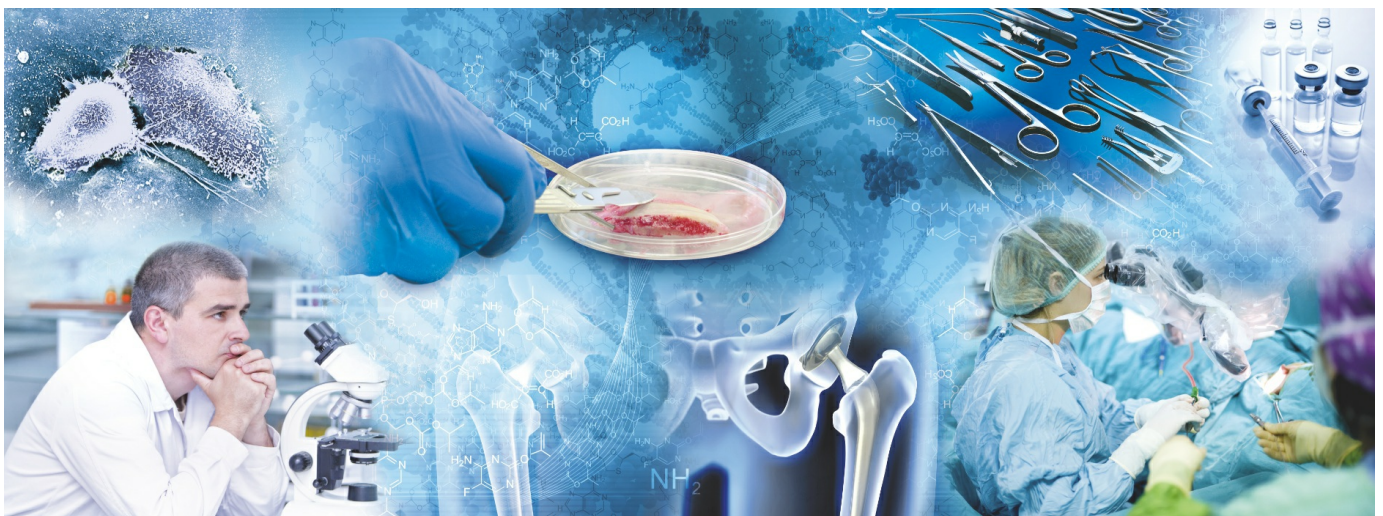
The range of products offered by medtech companies is very diverse and indispensable for human health and quality of life

Medical technology plays a discreet but efficient role in the field of healthcare. Many innovative medical products are so firmly anchored in everyday medical treatment that they are taken for granted, such as X-ray examinations or magnetic resonance imaging (MRI). The use of diagnostic tests, for example to determine the specific characteristics of tumours, also belongs to the field of medical technology. The days when the membrane of a heart-lung machine oxygenator was made from the same material as the skin of a sausage, or a ladies stockings company that also produced non-absorbable nylon threads used in surgery are long gone. Medical technology has long become an own economic sector that produces technologically advanced products. And suture material has also developed further, for example into special 'shape memory' suture materials that can be activated by a patient's body temperature.