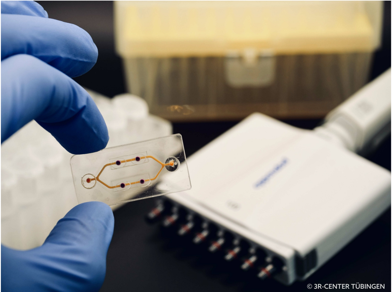
A model of a cervix has been developed on the Cervix-on-Chip. Substances are supplied and removed through the small channels.