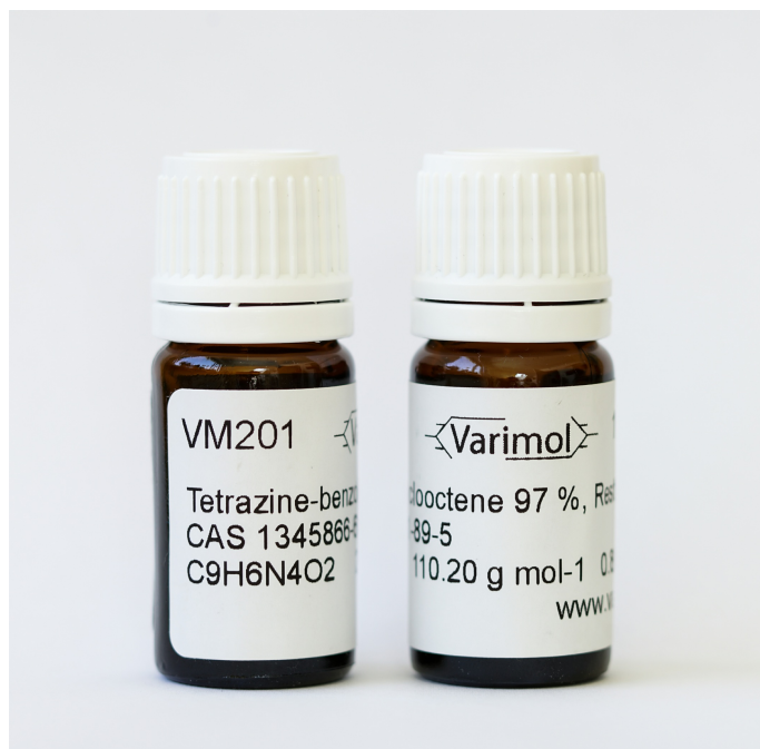
Varimol customers receive all the necessary reagents for their applications in two small bottles.

The major customers for the chemicals produced by the Stuttgart-based company are currently research institutions. However, the first university hospitals in Germany and increasingly throughout Europe have already started to purchase click reaction ingredients from the company. "Currently, we can only provide pharmaceutical companies with reagents for preclinical examinations," says the company founder. "We still lack the necessary certifications for clinical applications, and this possibility is not yet part of our future plans. However, we do not want to exclude this target group for the future either. We will decide later this year and the decision will very much depend on the interests of our customers. If we were to include reactions for clinical trials, this would not necessarily mean that we would have to be certified and change the whole laboratory. We could even commission a service provider who already possesses the necessary certifications for synthesising reagents for clinical trials."