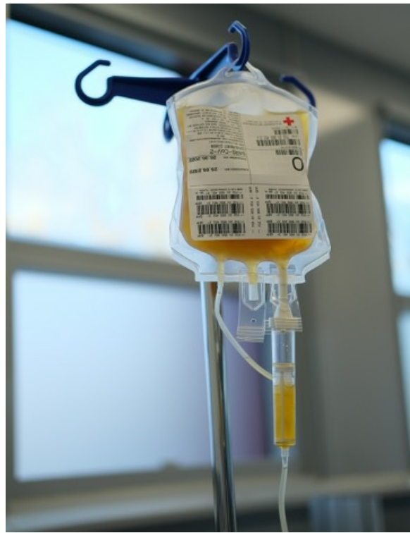
Blood plasma - its typical yellowish colour comes from the fact that it lacks red blood cells.

The great advantage of CP is its flexibility