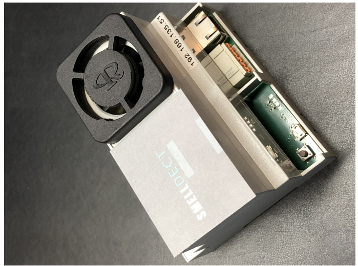
SMELLDECT GmbH produces and sells the eNose - a small device consisting of a chip, electronics and ventilation. The photo shows a fire monitor module that can be attached to computer cabinets.