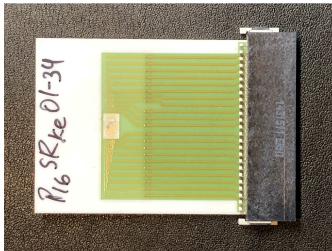
eNose consists of a chip with 16 individual sensors with tin dioxide nanowires.