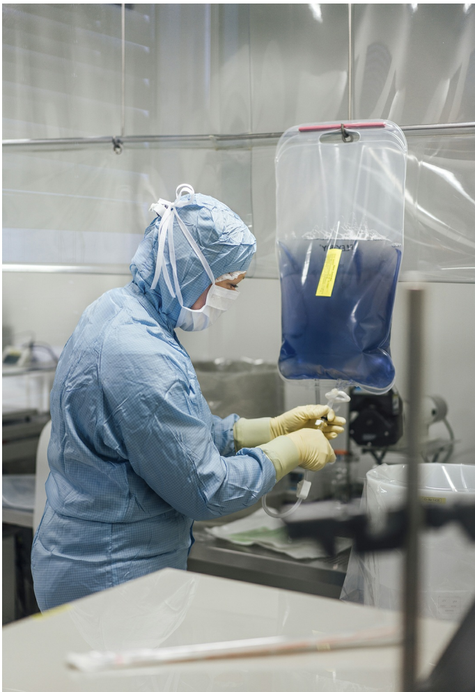
The mollusk's haemolymph is processed in Fellbach in accordance with good manufacturing practice (GMP) standards.