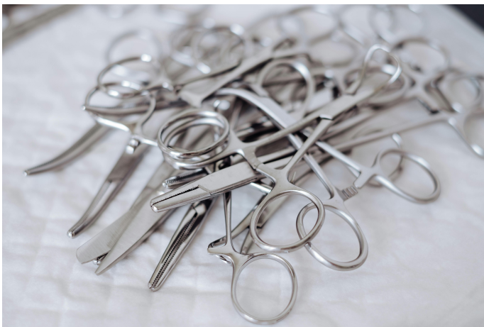
A transitional period is in place for surgical instruments, allowing until 30 June 2028 before the UKCA mark becomes mandatory.

CE marking serves as part of a product's declaration of conformity, where manufacturers confirm that all relevant legal requirements have been met. This applies to a range of products, including toys, machinery, electrical appliances and medical devices. Specific directives and regulations apply based on the product category, such as the EU Electromagnetic Compatibility (EMC) Directive for electrical and electronic products.