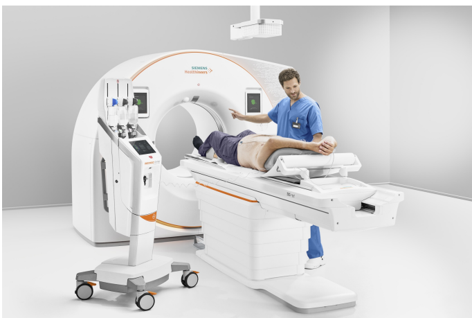
Examination with a photon-counting CT scanner.