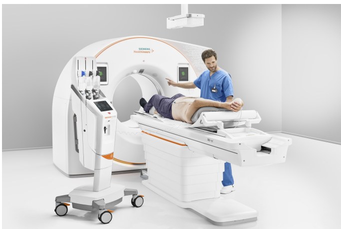
Examination with a photon-counting CT scanner.