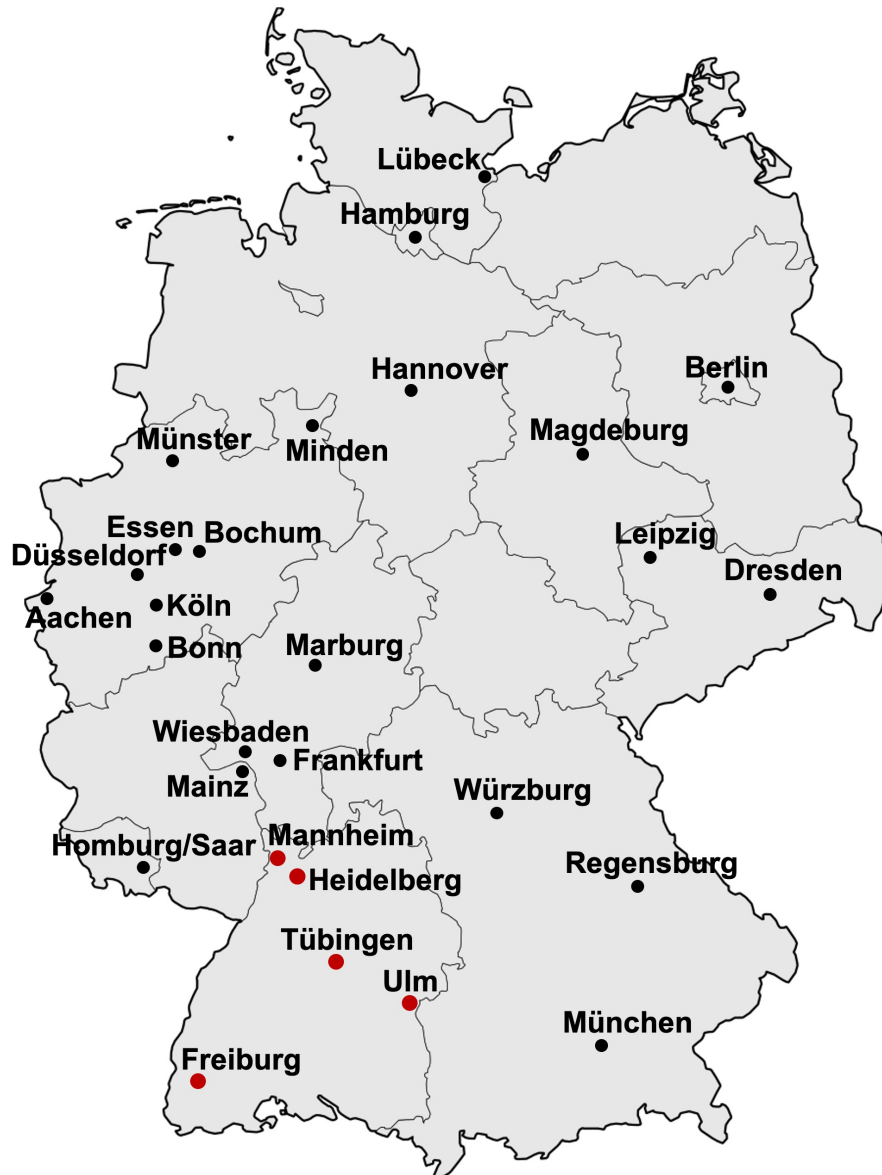
Black dots: Centres for rare diseases (ZSE – Zentrum für Seltene Erkrankungen) in German cities. Red dots: The ZSEs pooled in the Baden-Württemberg Competence Centre for Rare Diseases.

the patients, most of whom are children, are misdiagnosed at least once.